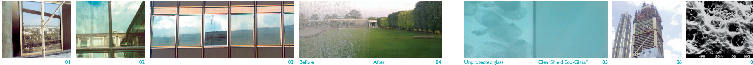
01 Contamination during construction 02 Silicone run-off 03 Hydrocarbon pollution 04 Residential glass 05 Sandblasted glass 06 Shanghai World Finance Center - ClearShield® applied to the glass in the factory prior to installation 07 The surface of glass is not smooth