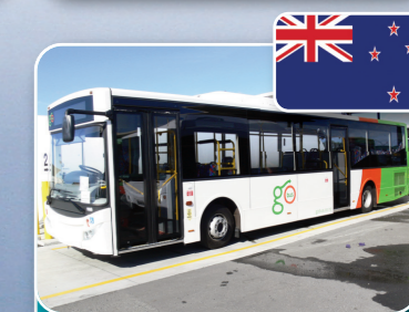
Go Bus Fleet