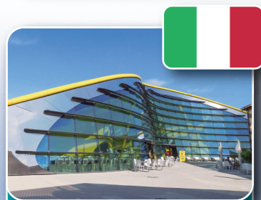
Museo Enzo Ferrari