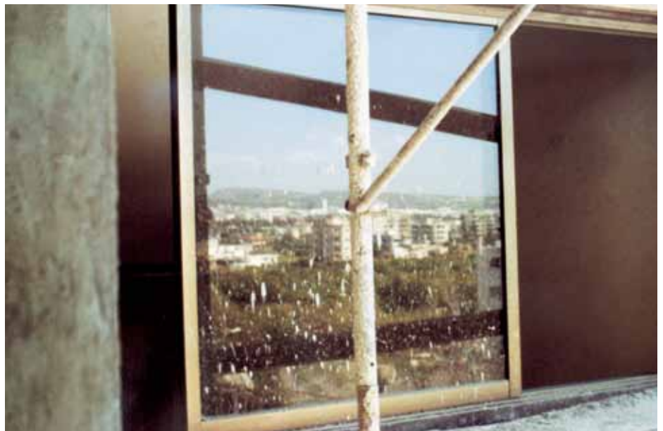
Problem Glass during installation

When new, glass is ‘good’ because it meets industry standards and has values such as –