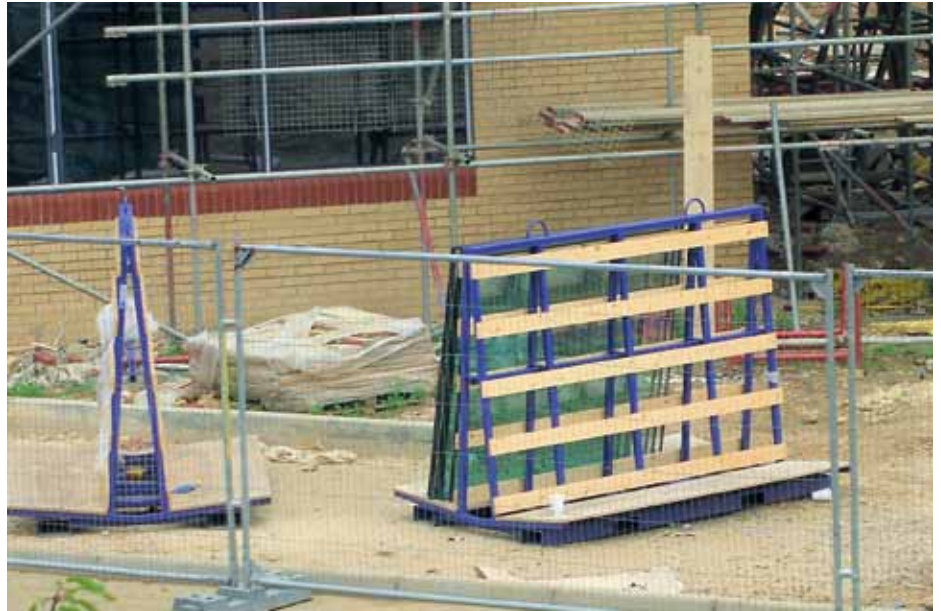
Problem Glass before installation

The ‘Good Glass Campaign’ is growing in numbers and strength by focusing on ways of adding real value at all steps of the architectural glass supply chain by maintaining or restoring the original performance standards or values of glass.