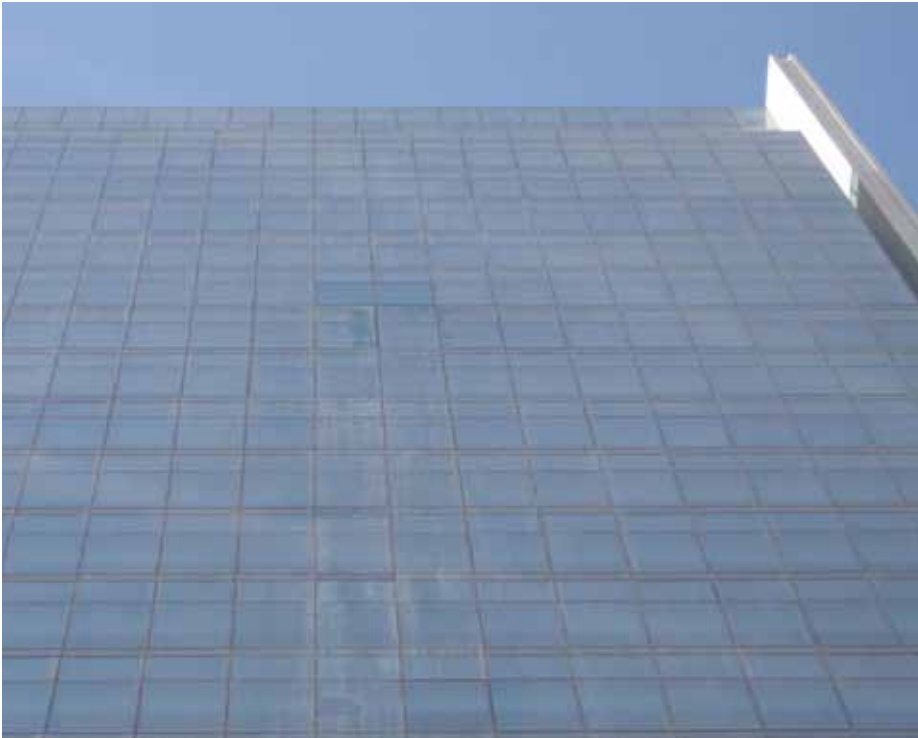
A building looking old before its time

In these and many other industries, the risks of unprotected surfaces are known to be so high that indifference is not a real factor. Glass should not be an exception, but it is!