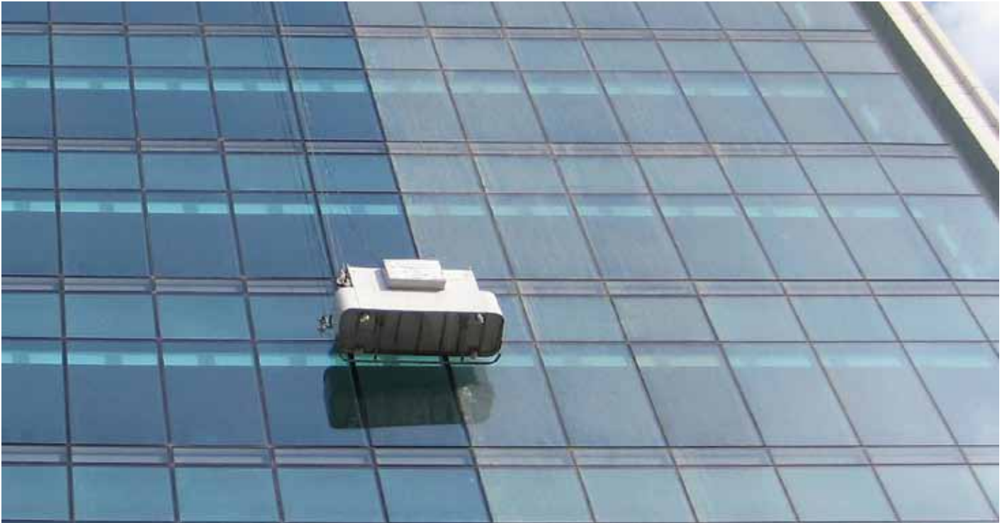
Solution for Problem Glass in progress