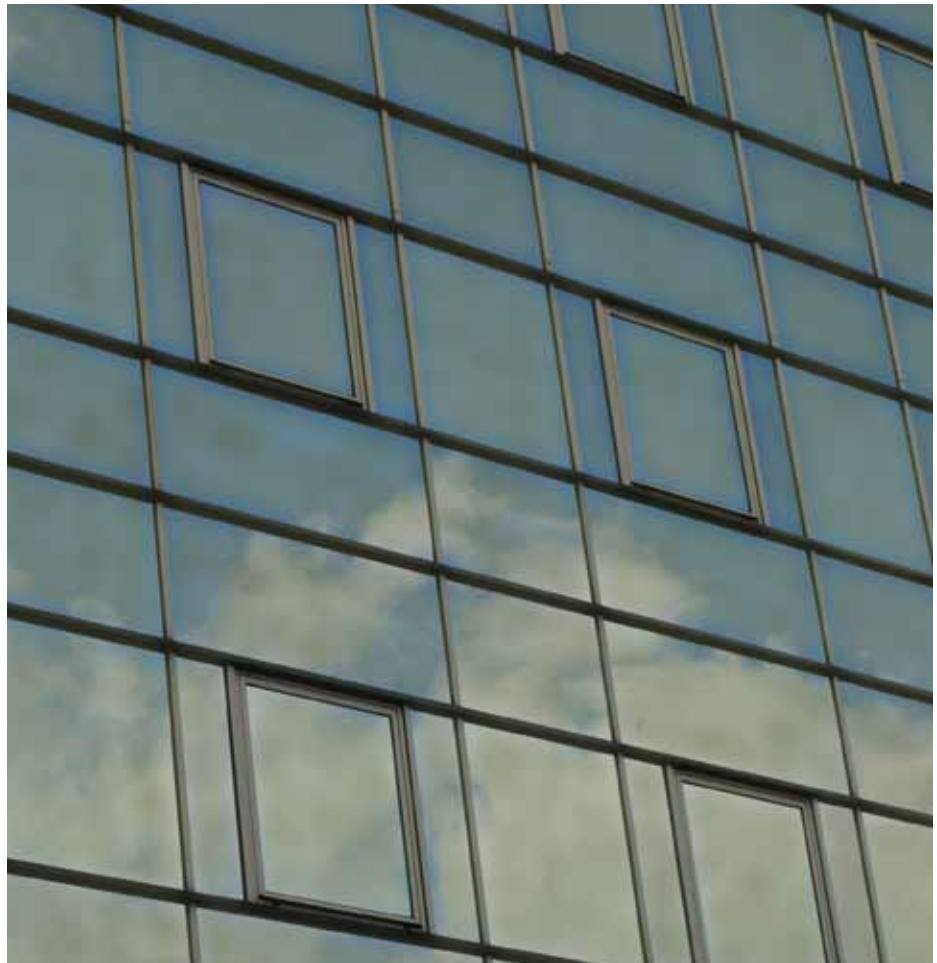
Problem Glass after installation

Inorganic dirt bonds chemically to glass and is difficult, if not impossible, to remove using